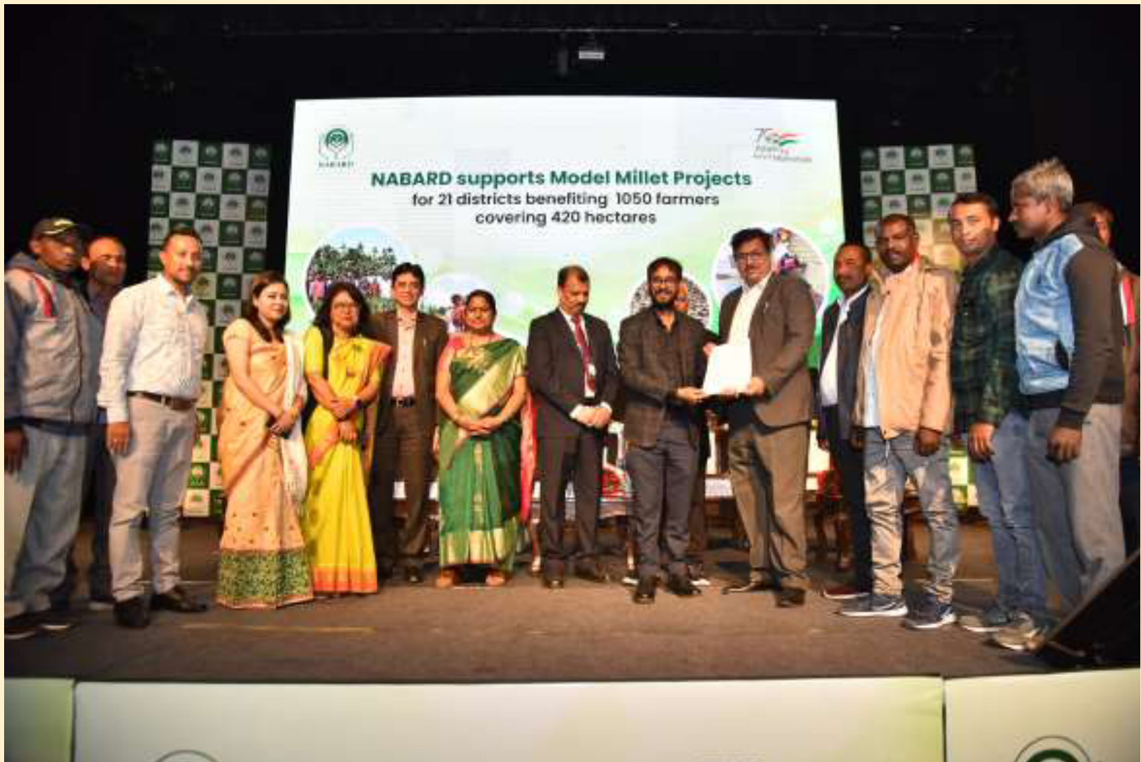
(Handing over Sanction letters to PIAs and farmers)