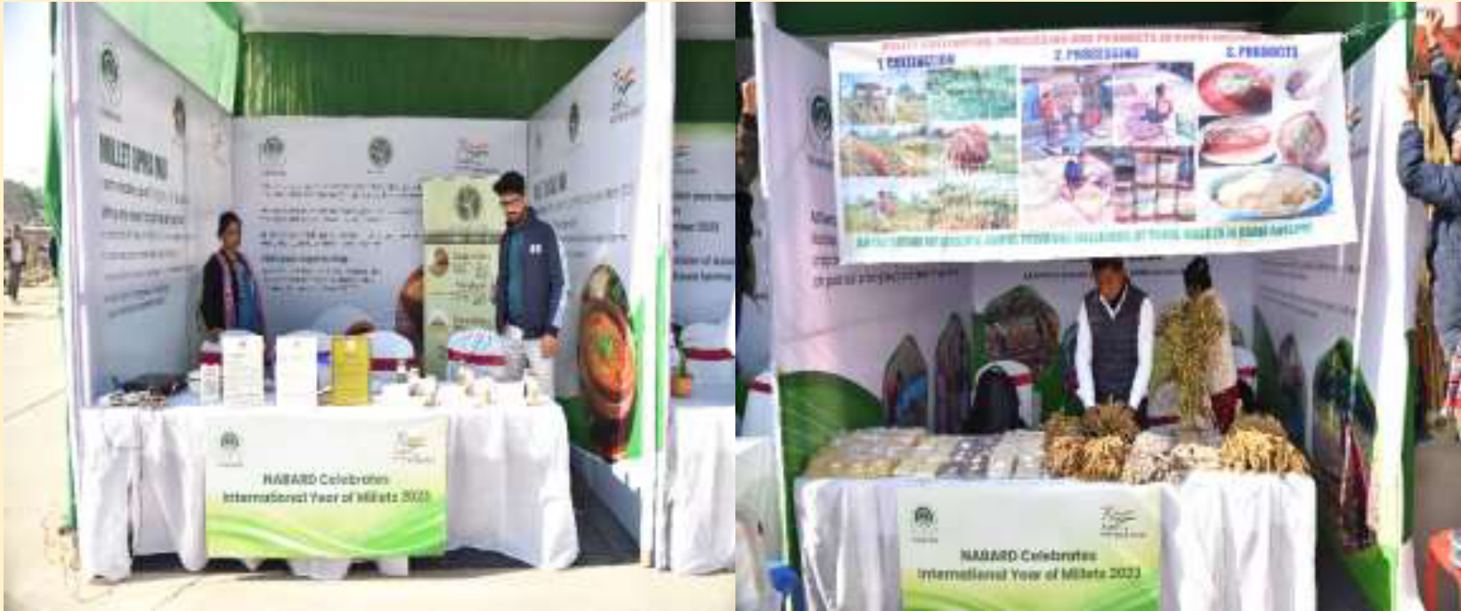
(Millet Stalls in the Venue)