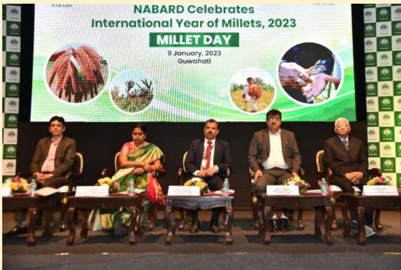
(Dignitaries on the dais)