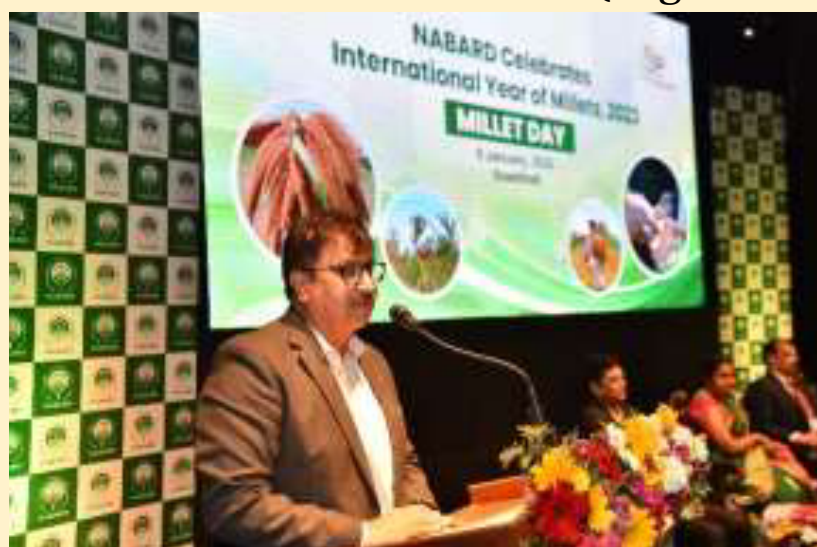
(CGM, NABARD addressing the participants)