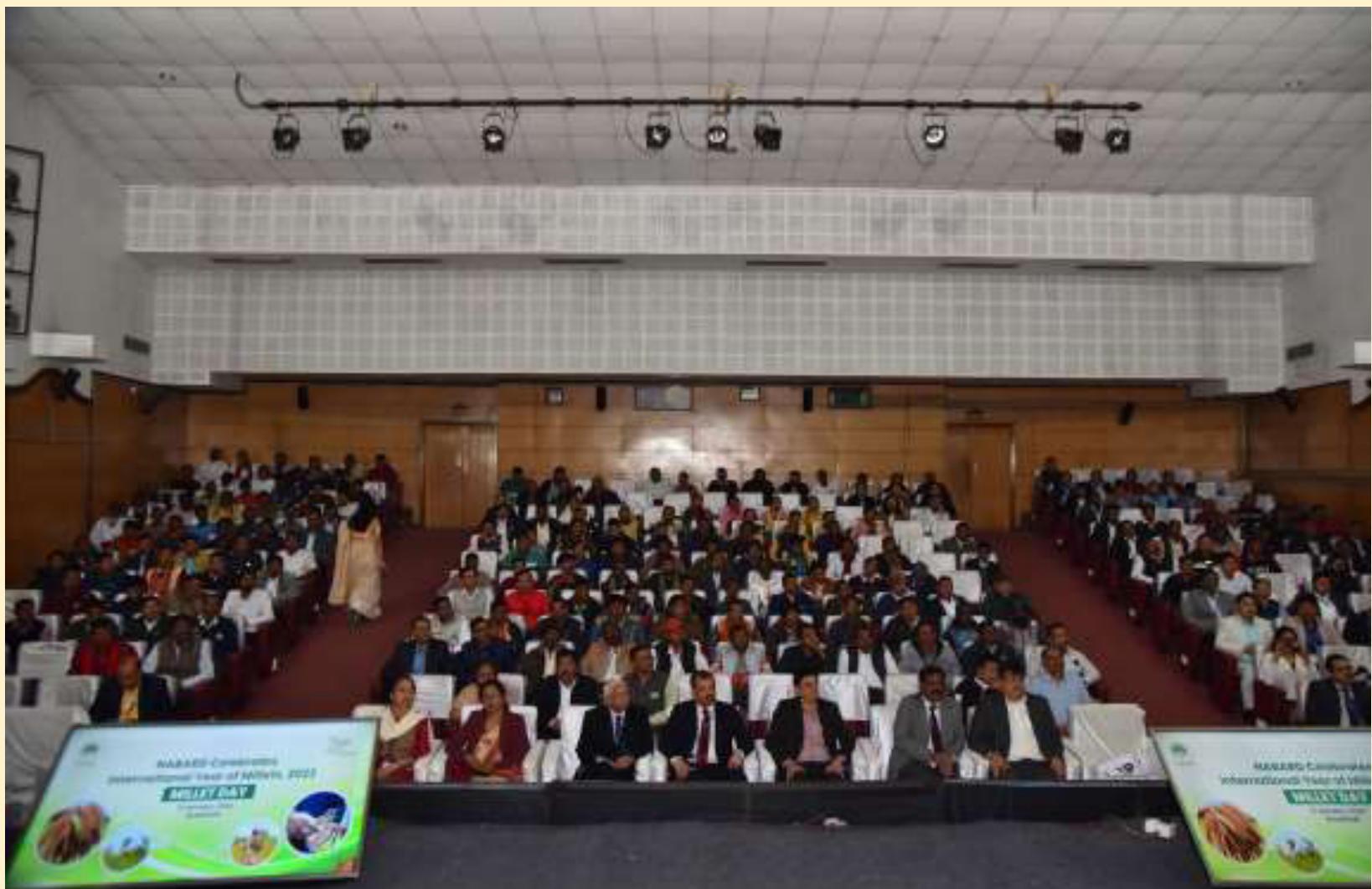
(A cross section of participants)