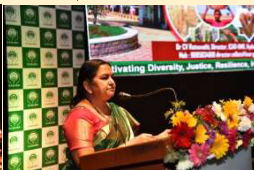
(Director, IIMR addressing the participants)