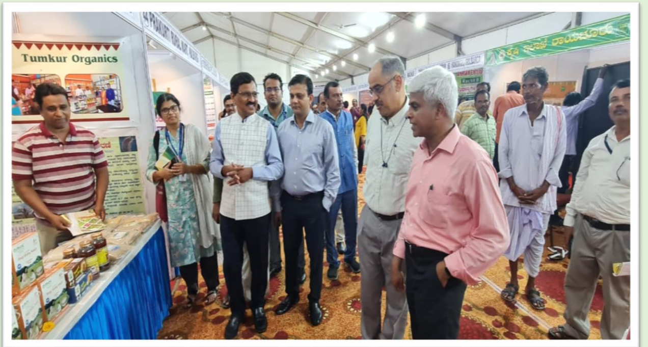
Visit to Stalls by Chairman and DMD NABARD