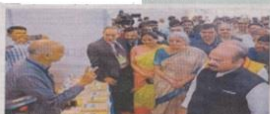
Union Ministers Nirmala Sitharaman, Shobha Karandlaje and Chief Minister Basavaraj Bommai at the two-day millet convention organised by the University of Agricultural Sciences in Raichur on Saturday.