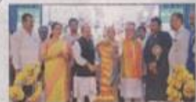
Union Finance Minister Nirmala Sitharaman inaugurating Millet Mile 2022 during the two-day millet conclave in Raichur on Saturday. Chief Minister Basavaraj Bommai and others are present.

“Holding Chief Minister Basavaraj Bommai for re-