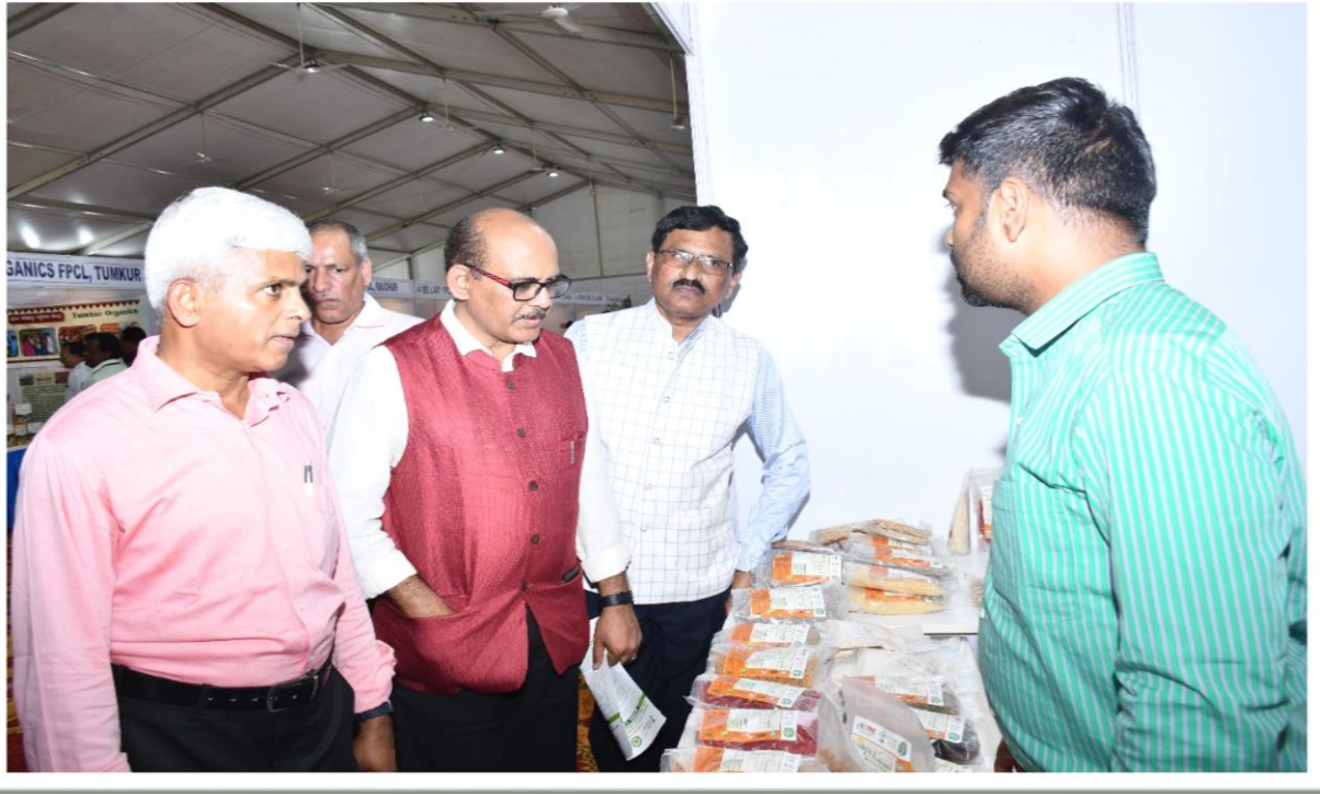
Interaction with stalls