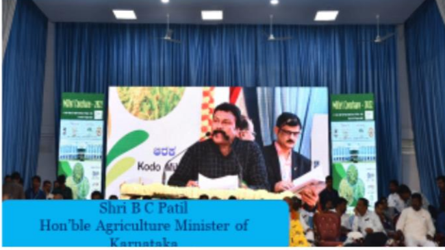
Shri B C Patil Hon'ble Agriculture Minister of Karnataka