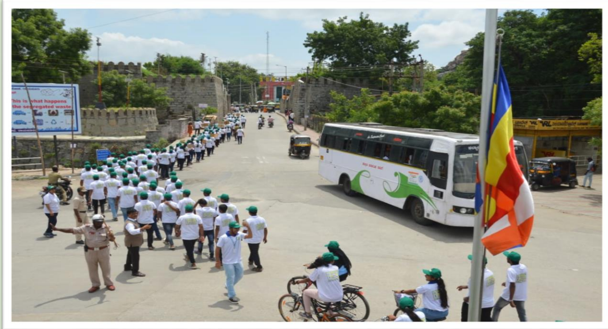
Millet Run at UAS Raichur on 25 th August 2022