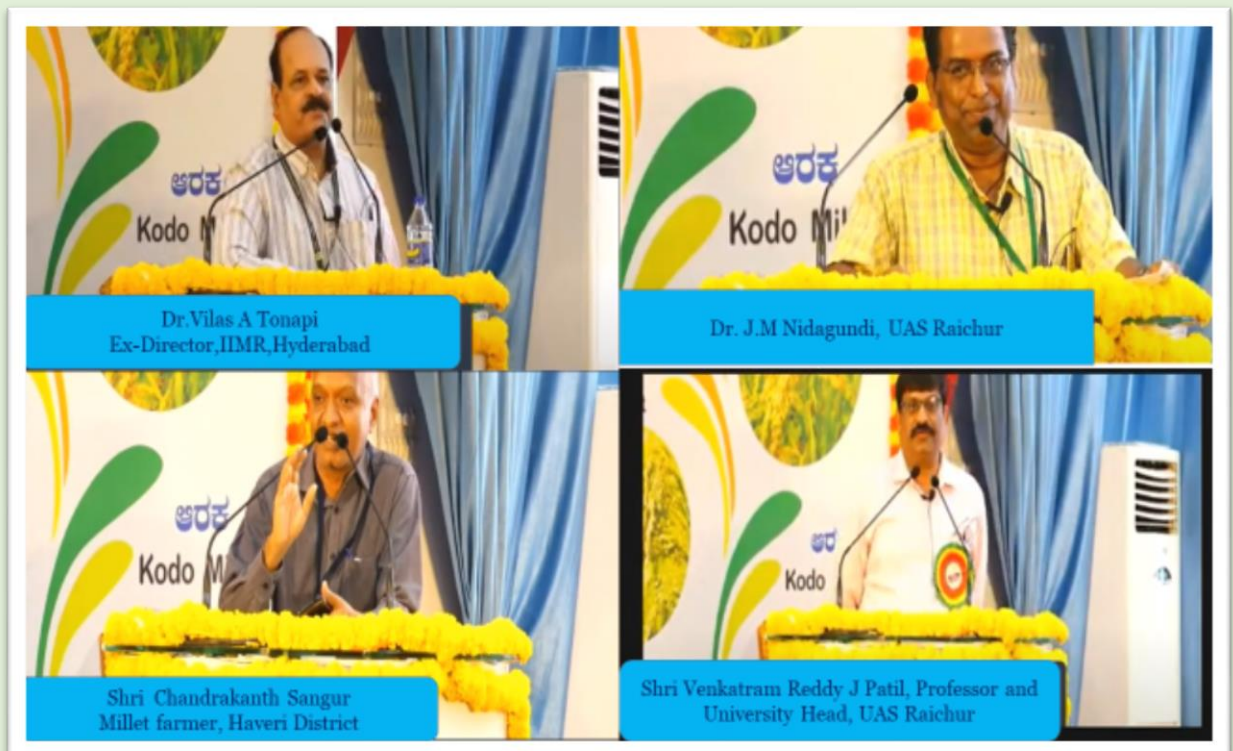
Technical Session I