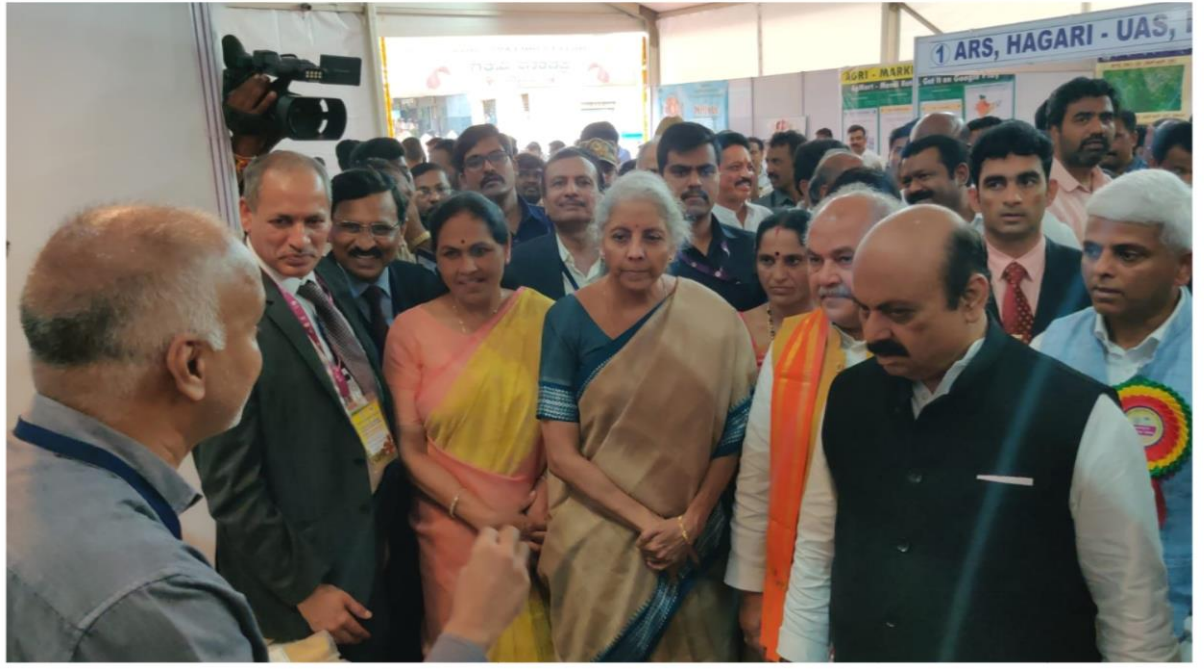
Hon'ble Ministers visit NABARD Stalls