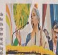
Union Finance Minister Nirmala Sitharaman speaking at the Millet Mile 2022 convention in Raichur on Saturday.

In 2022, India celebrated the year of millet and after Prime Minister Narendra Modi took a proposal to the United Nations to emphasize the importance of growing millets as healthy food, the world is now celebrating the International Year of Millets. This all happened because of the efforts, Union Finance Minister Nirmala Sitharaman has said.