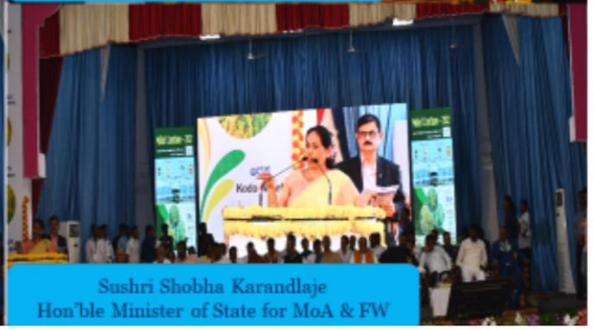
Sushri Shobha Karandlaje Hon'ble Minister of State for MoA & FW