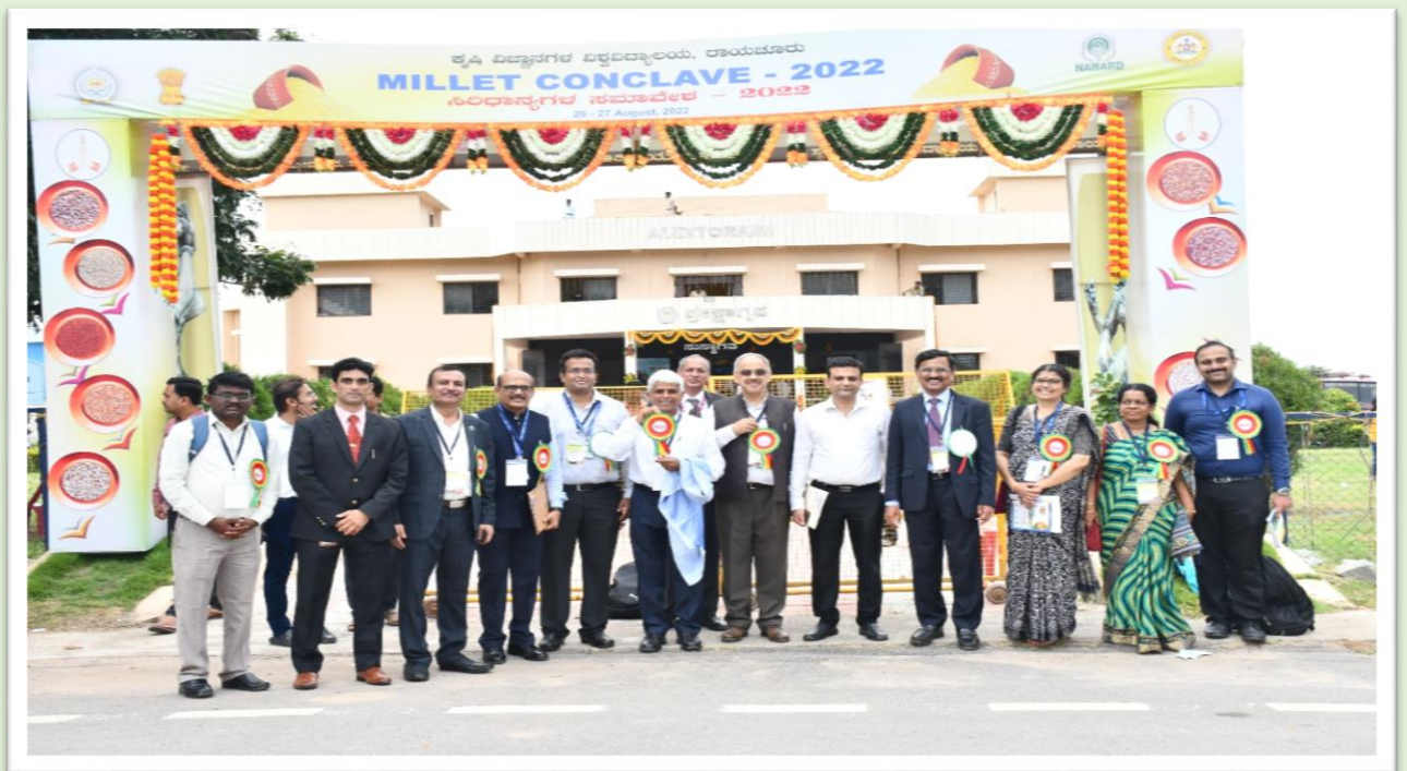
NABARD Team at the Millet Conclave