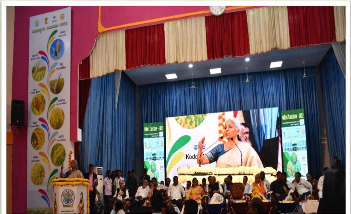
Address by Smt. Nirmala Sitharaman Hon'ble Finance Minister