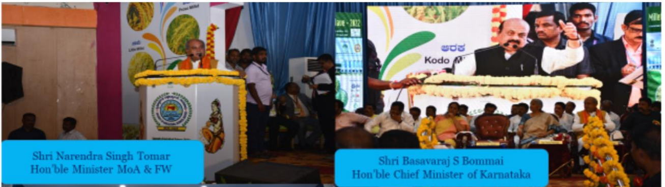
Shri Narendra Singh Tomar Hon'ble Minister MoA & FW