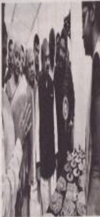
Union Finance Minister Nirmala Sitharaman and Chief Minister Basavaraj Bommai at the Millet Mile 2022 convention in Raichur on Saturday.

Union Finance Minister Nirmala Sitharaman on Saturday announced with a big sigh for the Kalyana-Karnataka region, announcing that the central government will approve a food processing unit for the area if a proposal is sent. “Taking part in the Millet Mile 2022 organised jointly by the University of Agricultural Sciences, Raichur and VASABD here on Saturday she said the central government will give priority to women. It will enjoy very high