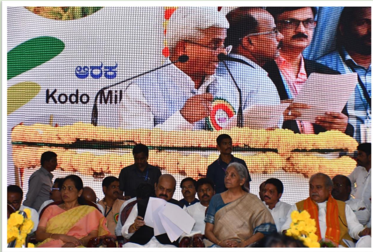
DMD (PVSS) presenting the key learnings