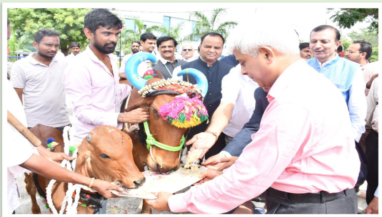
Go-Pooja-Traditional beginning for the event