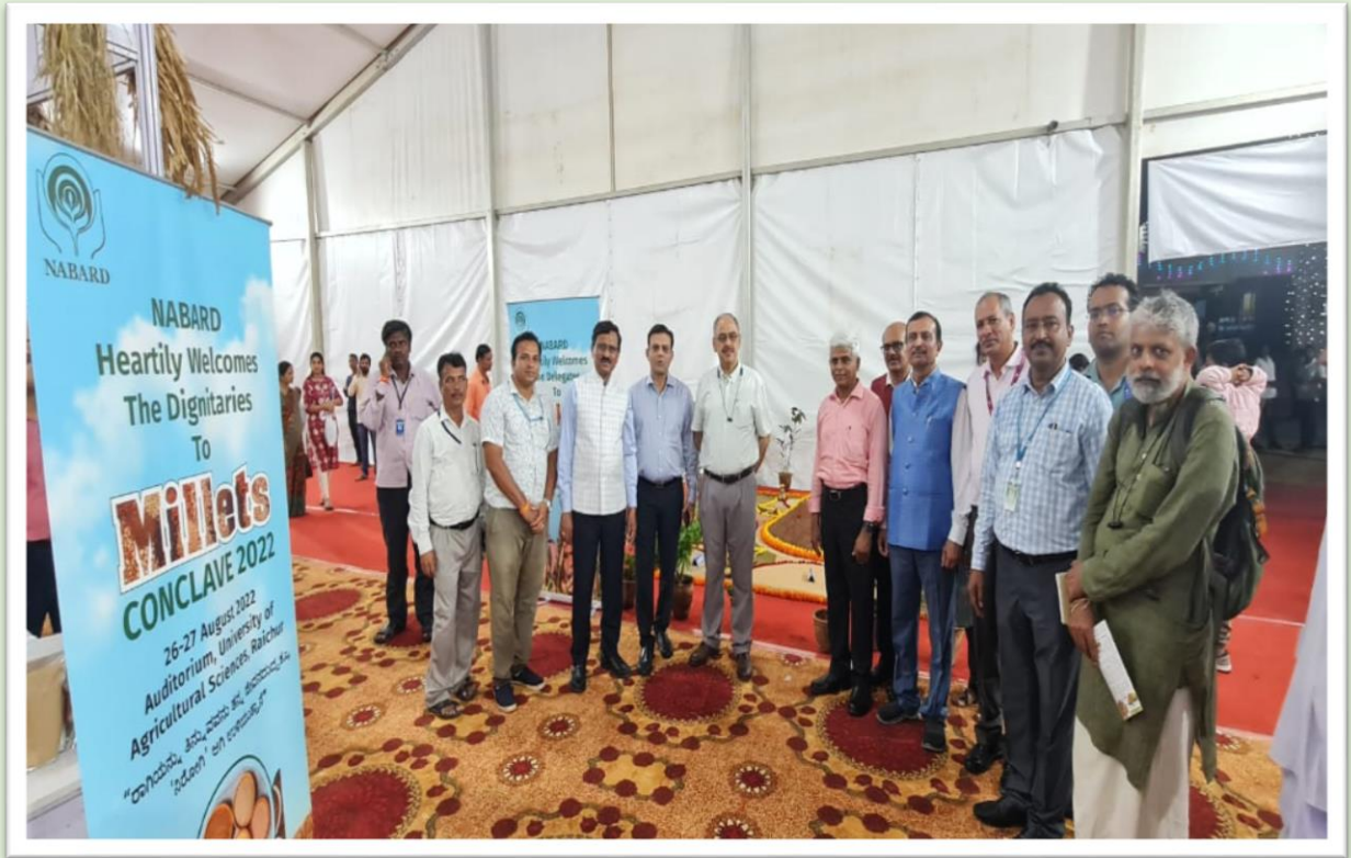
NABARD Team with UAS Raichur officials and FPOs at Millet exhibition