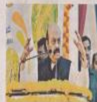
Chief Minister Basavaraj Bommai speaking at the Millet Mile 2022 convention in Raichur on Saturday.