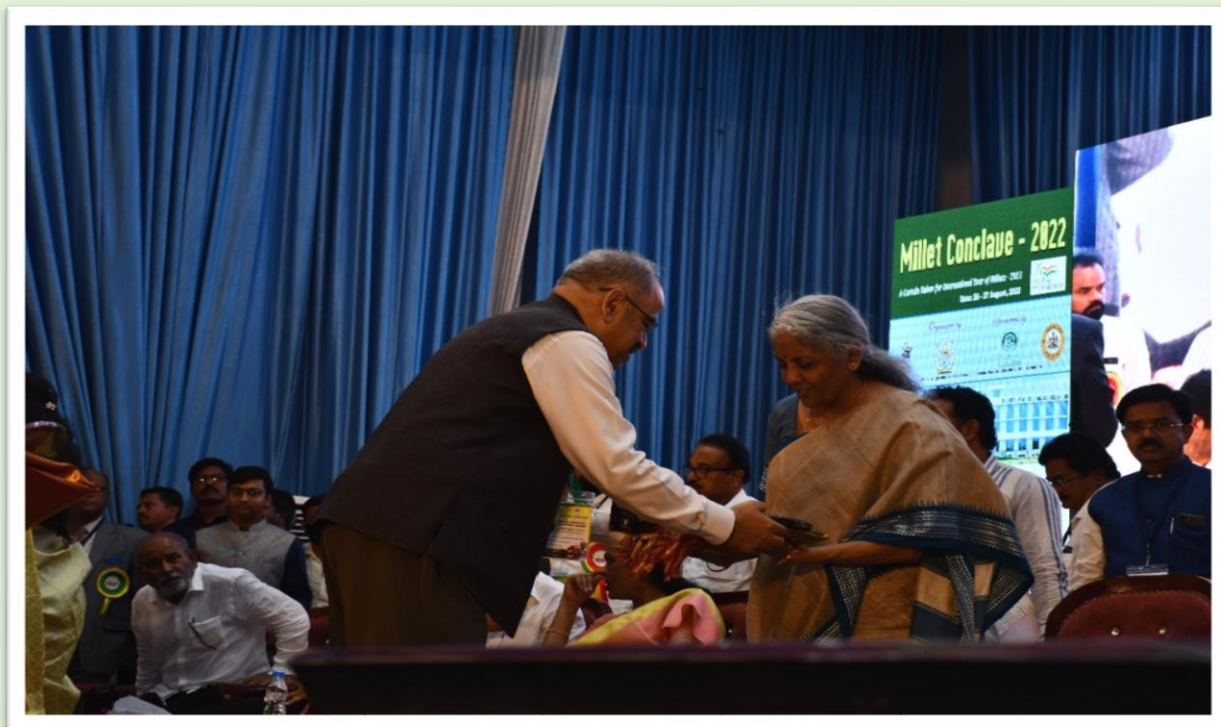
Shri. Suchindra Misra Chairman NABARD felicitating Smt Nirmala Sitharaman Hon'ble Finance Minister